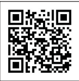
SCAN QR for Registration

Google Link : https://forms.gle/EsdUPMoV7ZJ2D7YN7