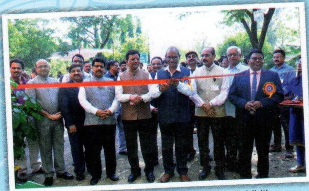
Inauguration of Poster & Model display Exhibition