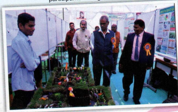
Guest Visit to the Exhibition