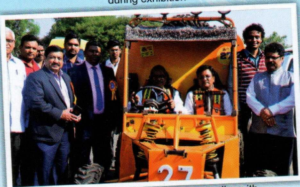
Interaction of Guest & Vice-Chancellor with the participants during Exhibition