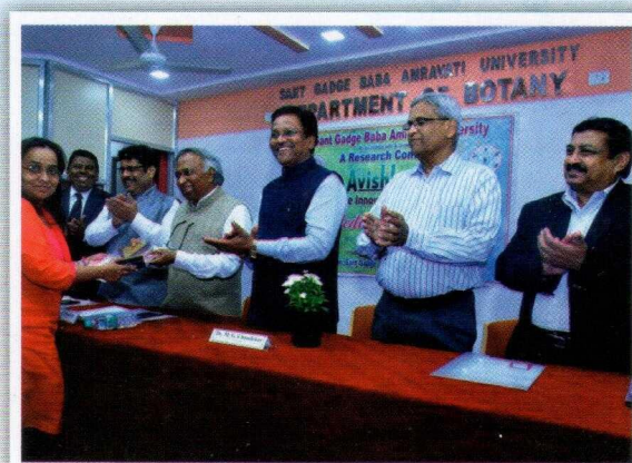
Prize Distribution at the hands of Chief Guest