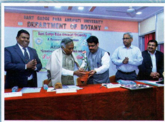
Floral Welcome to Prof. Vijay Bhatkar at Valedictory function