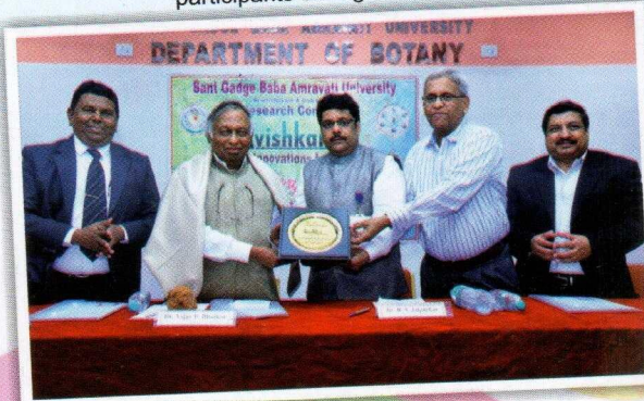
Felicitation of Prof. Vijay Bhatkar during the valedictory function