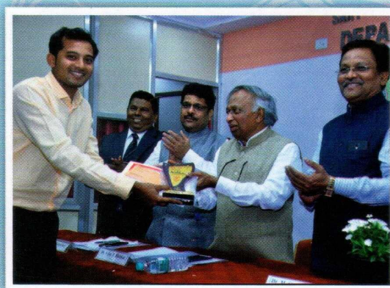
Prize Distribution at the hands of Chief Guest