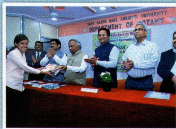
Prize Distribution at the hands of Chief Guest