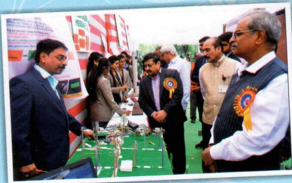
Interaction of Guest with participants during exhibition