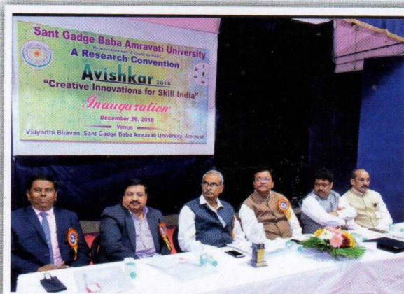
Inauguration of Avishkar-2018