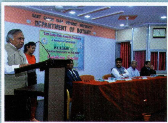
Address by Chief Guest Dr. Vijay Bhatkar