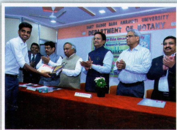
Prize Distribution at the hands of Chief Guest