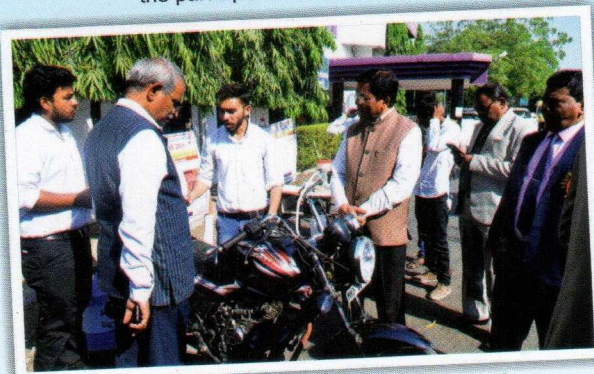
Interaction of Guest & Vice-Chancellor with participants during Exhibition