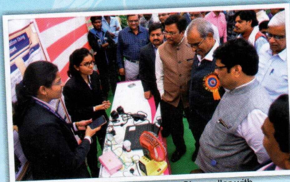
Interaction of Guest & Vice-Chancellor with the participants during Exhibition