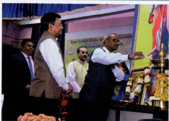
Inauguration of Avishkar-2018 by lightning of lamps