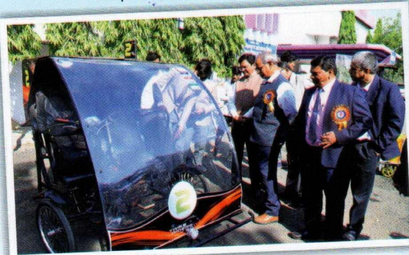
Interaction of Guest & Vice-Chancellor with participants during Exhibition