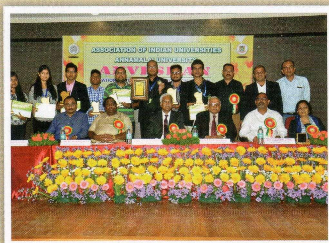
Our Prize winners at National Level Avishkar 2017