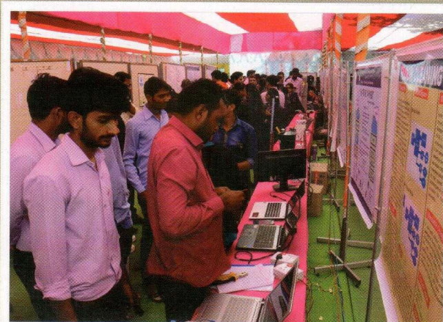
Presentation of Models by Participants at University Level Aviskar