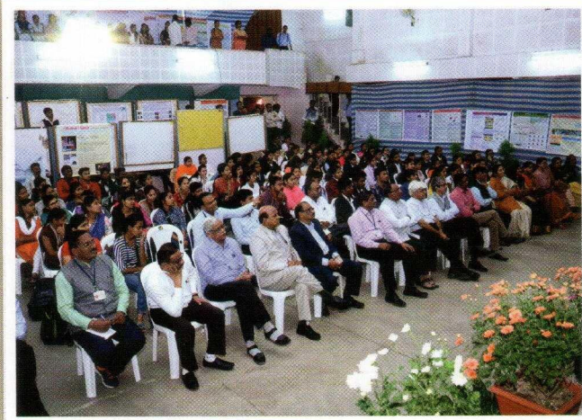
Inauguration of Avishkar 2017