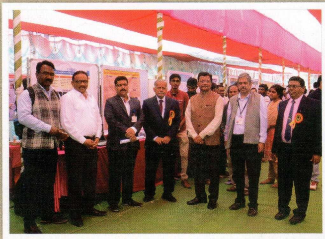
Guest with Avishkar Committee