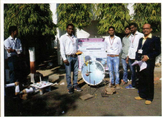
Displaying Models of University Level Avishkar 2017